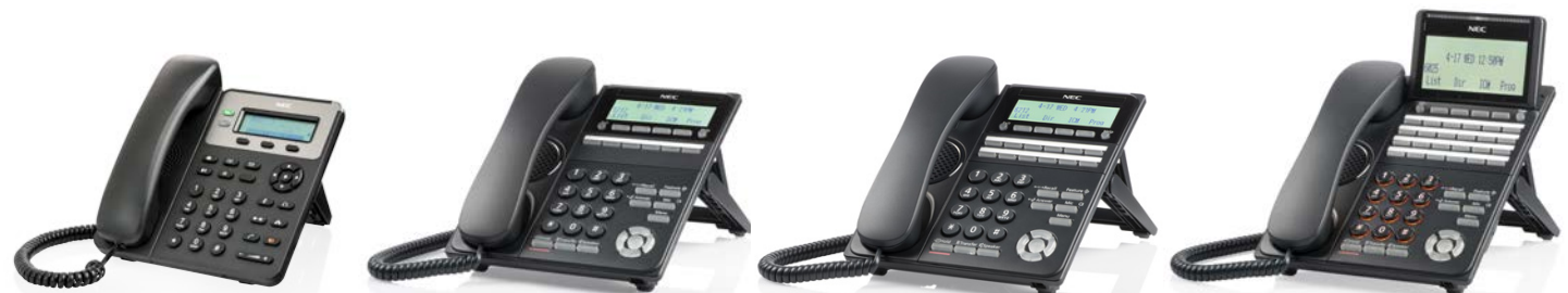
Mono: Easy call control from the office

For the full range of SV9100 handsets visit www.nec-enterprise.com for further details.