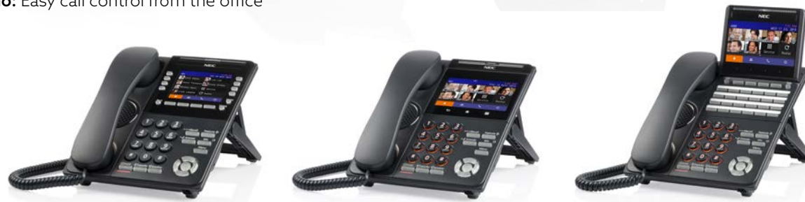
Colour: Easy call control from the office, remote or home-based working, hot-desking